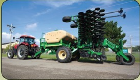
NARROW TRANSPORT - Transport width is just under 3m.