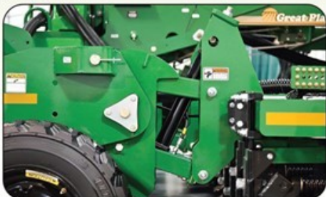
HYDRAULIC DOWN PRESSURE - The NTA-3007 Air Drill features a unique hydraulic down-pressure system which, through parallel linkage, maintains opener-to-ground geometry.