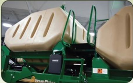
HIGH-CAPACITY HOPPERS - Two (2) 3 524 l hoppers, wide walk boards, and ladders combine to make an air drill that keeps you in the field.