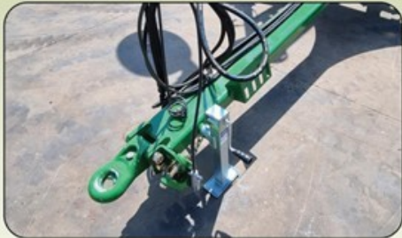
LOW-PROFILE FLOATING HITCH - New low-profile hitch with heavy duty ball joint attachment and convenient hose storage area.