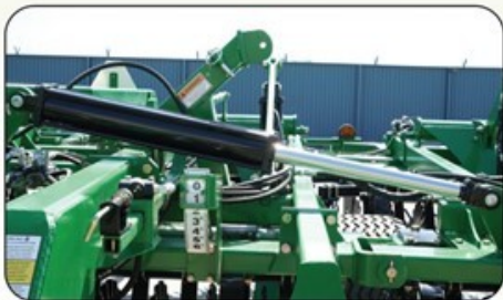
FOLDING SYSTEM - Folding system with heavy hinges on both inside and outside wings.