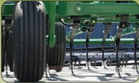
SHANK - Shank spacing around tyres and throughout the machine with no shanks closer than 71 cm on the entire implement.